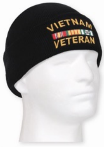
5373 DELUXE VIETNAM VETERAN EMBROIDERED WATCH CAP, 100% fine knit acrylic