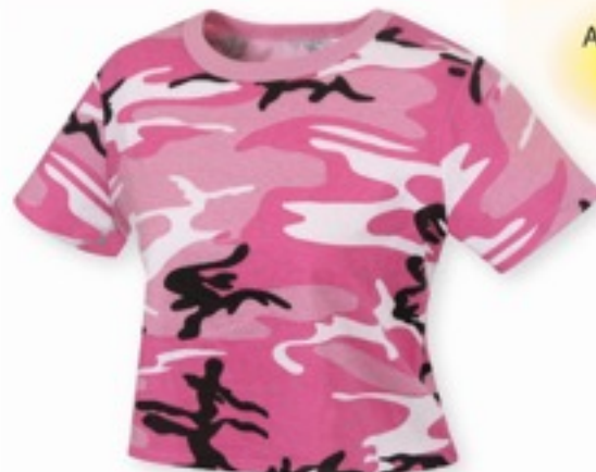
1943 PINK CAMO