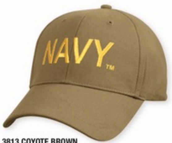
3813 COYOTE BROWN W/GOLD 'NAVY'