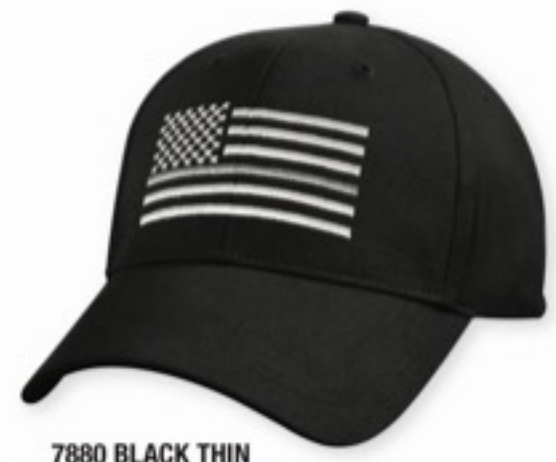
7880 BLACK THIN SILVER LINE FLAG ^