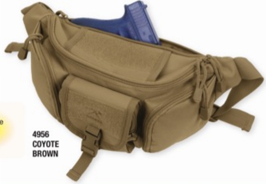
4956 COYOTE BROWN