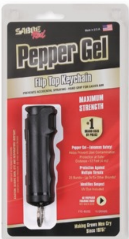
11021 SABRE RED PEPPER GEL WITH FLIP TOP , maximum strength pepper spray, hard case w/comfort finger grip & key ring, shoots 12', safe to use indoors, 15 grams**