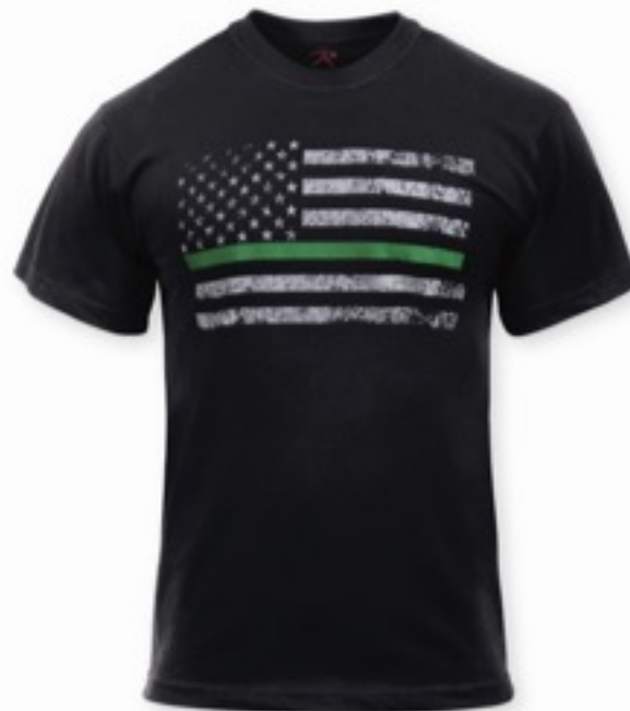
2693 ROTHCO BLACK THIN GREEN LINE FLAG T-SHIRT , cotton/poly, tagless label, Sizes: S to XL 2694 2XL 2695 3XL ^