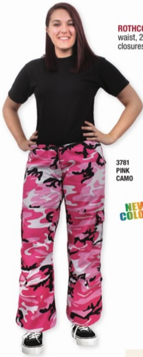
3781 PINK CAMO

ROTHCO WOMENS PARATROOPER FATIGUES , 55% cotton/45% polyester, low drawstring waist, 2 front slash pockets, 2 rear pockets, 2 cargo pockets & 2 calf pockets w/button flap closures, zipper fly, ankle drawstrings, Sizes: XXS to XL