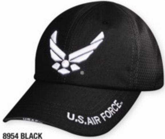
8954 BLACK USAF WING

ROTHCO MESH BACK EMBROIDERED TACTICAL CAPS , two 100% cotton front panels, 4 polyester mesh back panels, 2 reinforced air vent holes, embroidered insignia on front panel & brim, sandwich bill, back strap insignia, hook & loop closure