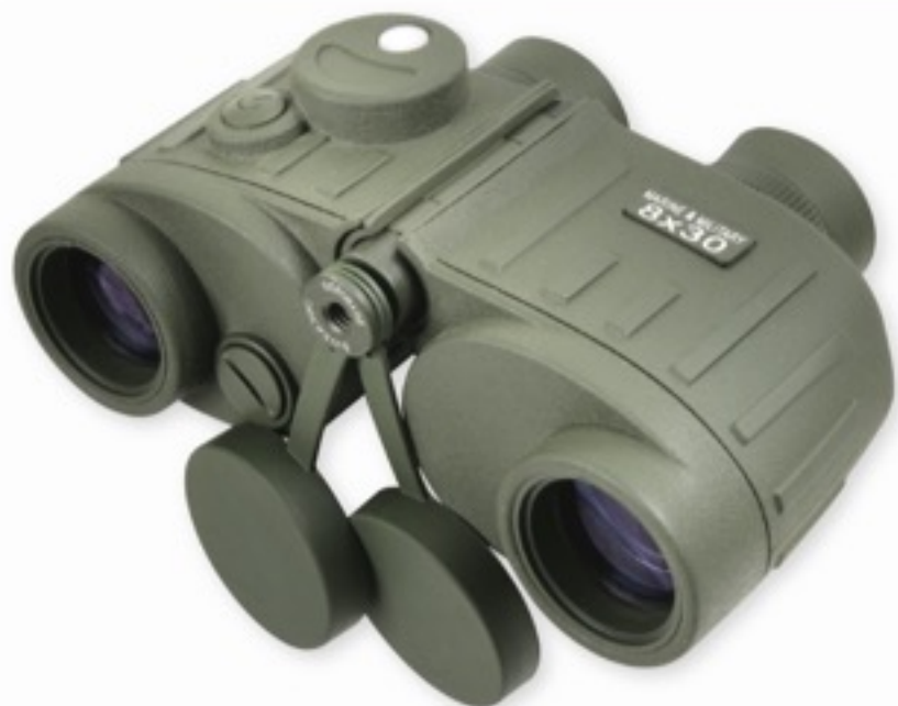
2024 ROTHCO O.D. MILITARY TYPE 8 X 30MM BINOCULARS , water & fog proof, floats in water, built in compass, O-ring sealed & nitrogen filled, range finding reticle, illumination reading, range finding dial, multi-coated lens, 8x magnification, 8° field of view @ 1000m, includes nylon case, cleaning cloth and 2 batteries*