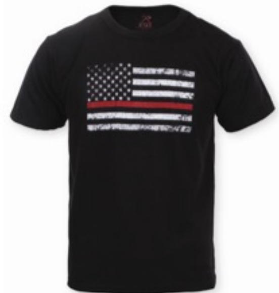
6868 ROTHCO KIDS BLACK THIN RED LINE FLAG T-SHIRT , cotton/poly, tagless label, Sizes: XS to XL ^