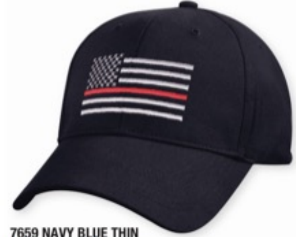
7659 NAVY BLUE THIN RED LINE FLAG ^