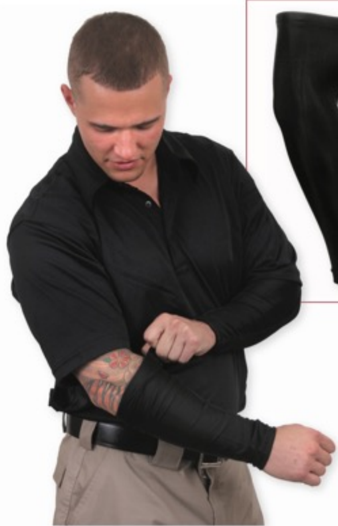
1199 ROTHCO BLACK TACTICAL COVER UP ARM SLEEVES , 90% polyester/10% spandex, moisture wicking, non-slip top rubber inside provides a secure fit, use for extra warmth or to cover up tattoos in the field, Sizes: SM/MD, LG/XL