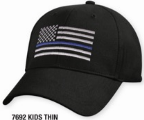
7692 KIDS THIN BLUE LINE FLAG ^