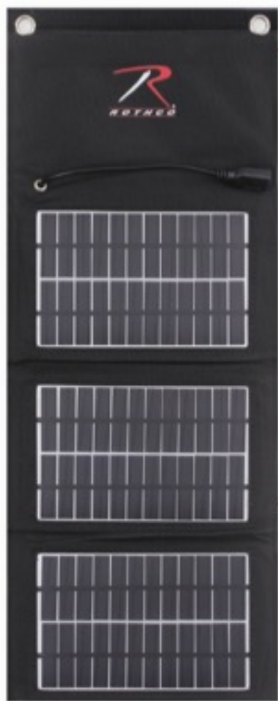
2116 SOLAR PANEL, NO POWER BANK