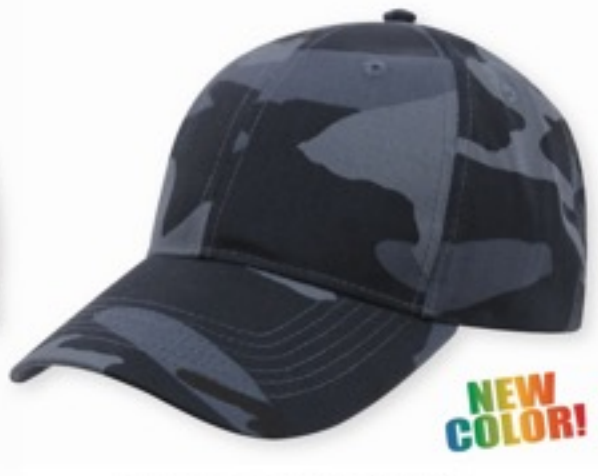
7960 ROTHCO MIDNIGHT BLUE CAMO LOW PROFILE CAP, comfortable 100% brushed cotton twill, adjustable hook & loop closure