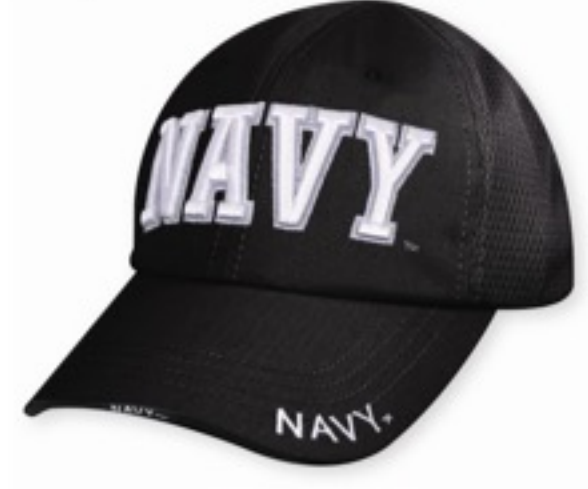
3879 BLACK NAVY