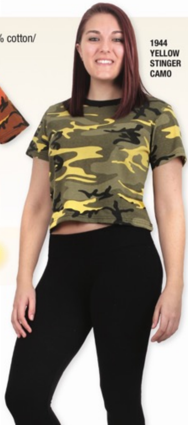
1944 YELLOW STINGER CAMO