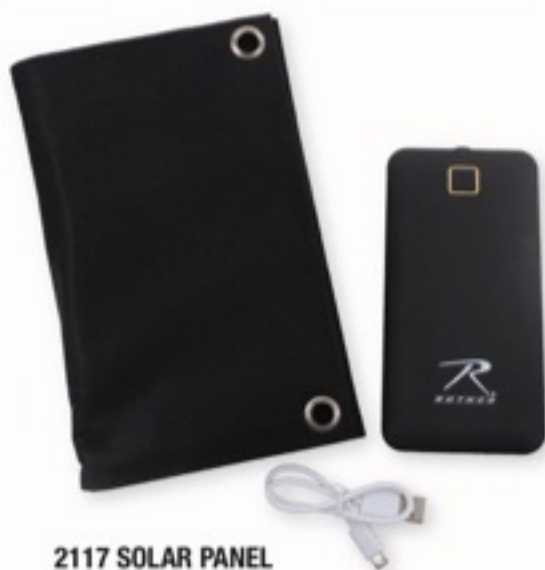
2117 SOLAR PANEL W/POWER BANK

2116 ROTHCO BLACK M.O.L.L.E. FOLDING SOLAR PANEL , durable nylon material, 7.5W Monocrystalline cell solar panel, USB output, 2 M.O.L.L.E. attachment straps, 2 grommets, boxed, 20 3 / 8 " x 8" x 1/2" open, 8" x 5" x 3/4" closed, also sold W/POWER BANK (2117) , 5,000mah power bank features: built-in lithium battery, dual USB charging ports & micro USB input