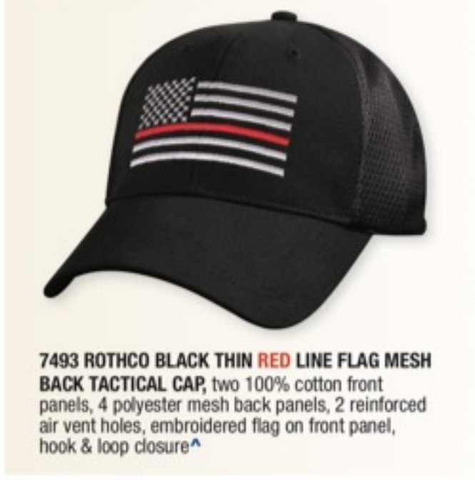
7493 ROTHCO BLACK THIN RED LINE FLAG MESH BACK TACTICAL CAP, two 100% cotton front panels, 4 polyester mesh back panels, 2 reinforced air vent holes, embroidered flag on front panel, hook & loop closure ^

ROTHCO MESH BACK EMBROIDERED TACTICAL CAPS , two 100% cotton front panels, 4 polyester mesh back panels, 2 reinforced air vent holes, embroidered insignia on front panel & brim, sandwich bill, back strap insignia, hook & loop closure