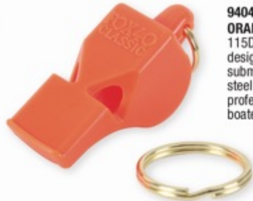
9404 FOX 40 CLASSIC ORANGE SAFETY WHISTLE , 115Db, 3-chamber pealeless design clears itself when submerged in water, stainless steel rustproof ring, great for professionals, rescue workers, boaters, etc., carded*