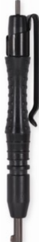
1017 ROTHCO BLACK EASY GRIP HANDCUFF KEY W/CLIP , 3 3/4" long, textured handle w/finger groove, fits most standard double lock handcuffs, blister carded

These items are manufactured by a U.S. factory and certified by the Institute of Heraldry