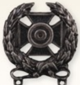
1540 ARMY EXPERT WEAPONS QUALIFICATION BADGE , pin back, carded, U.S. made*