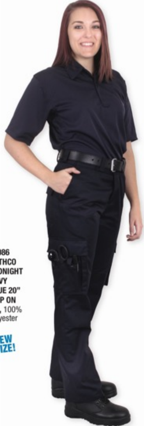
5658 ROTHCO WOMENS MIDNIGHT NAVY BLUE E.M.T. PANT , 65% poly/35% cotton twill, zipper fly, lower waist, EZ-fit expandable waistband, reinforced knees, 9 pockets: 2 front slash pockets with right inside accessory pocket, 2 back pockets w/hook & loop closures, 1 large bellows pocket, 1 large double bellows pocket w/hook & loop closure and vertical instrument pocket w/snap closures, 31" inseam, Sizes: 2, 4, 6, 8, 10, 12, 14, 16, 18, 20, 22