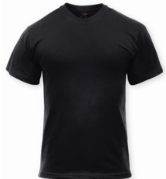
6913 KIDS BLACK T-SHIRT , cotton/poly, tagless label, Sizes: XS to XL