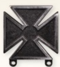
1542 ARMY MARKSMAN WEAPONS QUALIFICATION BADGE , pin back, carded, U.S. made*