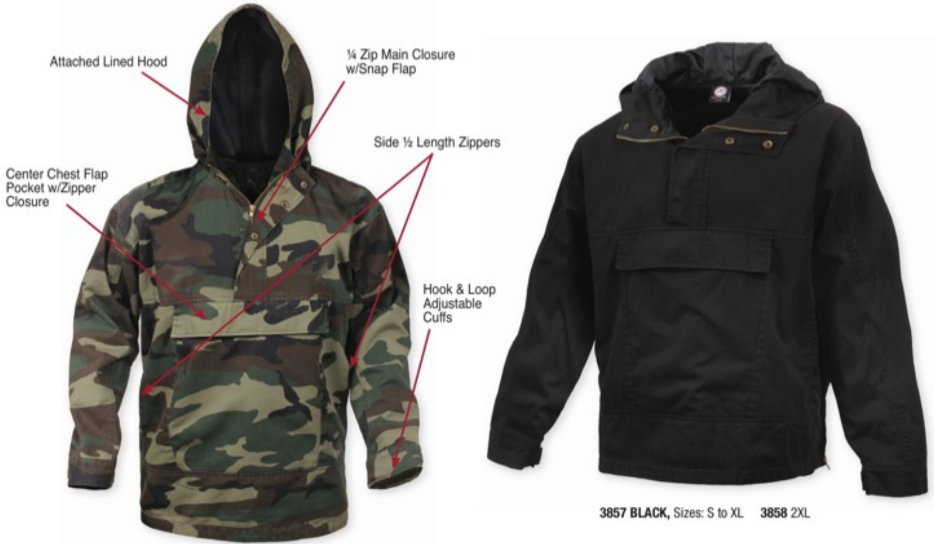
3847 WOODLAND CAMO , Sizes: S to XL 3848 2XL

ROTHCO ANORAK PARKAS , 55% cotton/45% polyester fabric, 100% polyester lining throughout, Sizes: S to 2XL