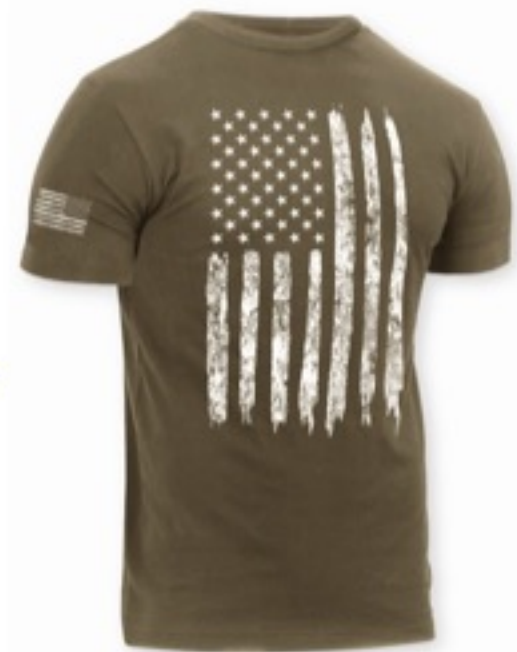
2632 ROTHCO COYOTE BROWN DISTRESSED FLAG ATHLETIC FIT T-SHIRT , cotton/poly, distressed flag on chest & right sleeve, ring spun combed cotton, tagless label, Sizes: S to XL 2633 2XL 2634 3XL