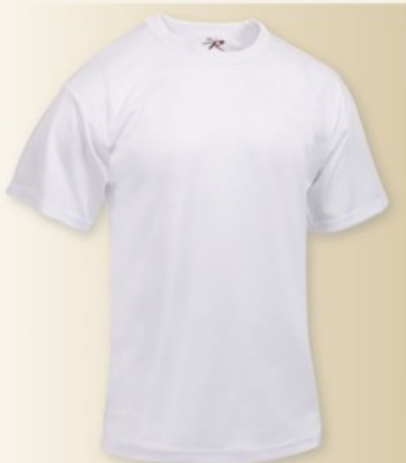
2730 WHITE , S to XL 2731 2XL 2732 3XL