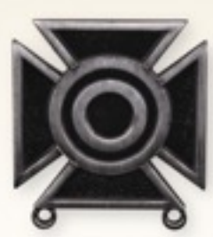
1539 ARMY SHARPSHOOTER WEAPONS QUALIFICATION BADGE , pin back, carded, U.S. made*

These items are manufactured by a U.S. factory and certified by the Institute of Heraldry