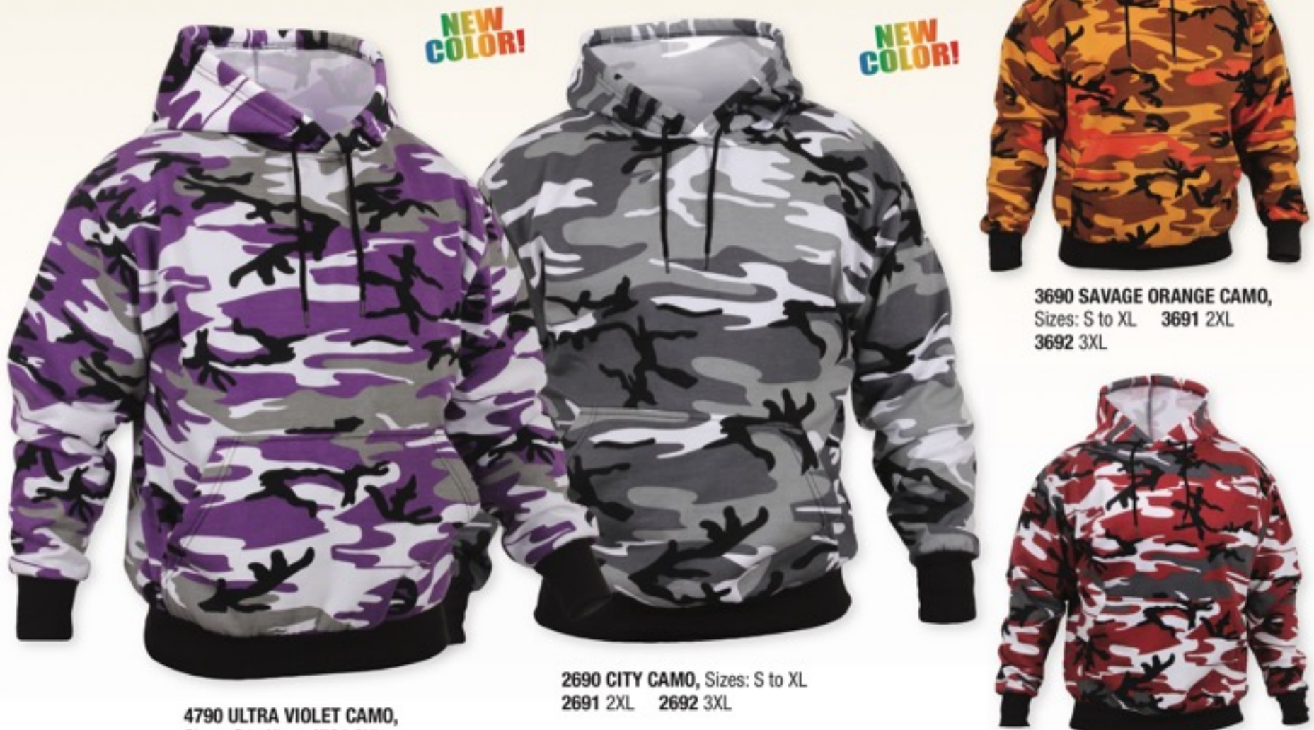
4790 ULTRA VIOLET CAMO , Sizes: S to XL 4791 2XL 4792 3XL

ROTHCO CAMOUFLAGE PULLOVER HOODED SWEATSHIRTS , cotton/poly outer shell, fleece lined, 2 front slash pockets, elastic knit wrist cuffs and waistband, Sizes S to 3XL, Available in 4 great new colors!