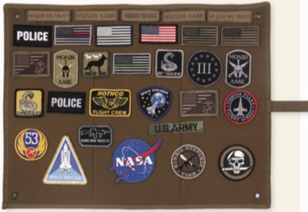
9010 ROTHCO COYOTE BROWN HANGING ROLL-UP MORALE PATCH BOARD , 600D polyester, loop material for morale patch attachment, 4 grommets for hanging on wall, rolls up for easy storage, hook & loop strap closure, 24" x 18 1/2" open