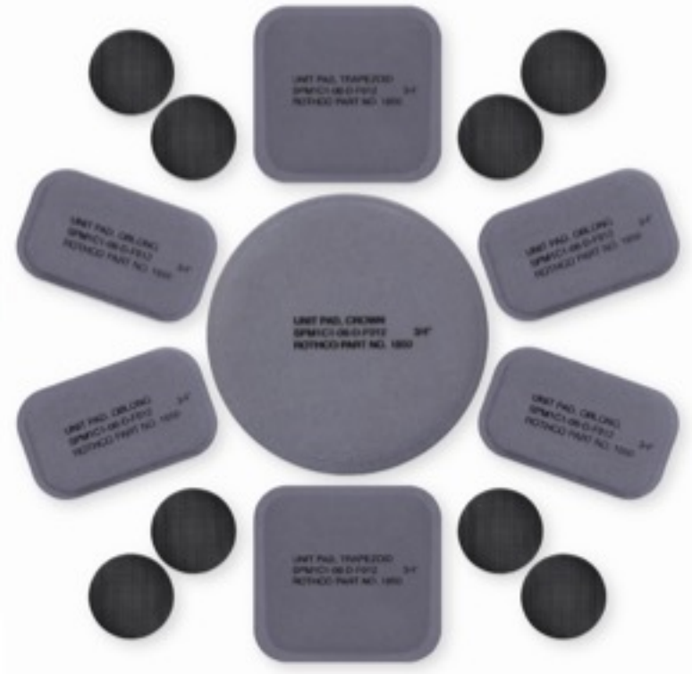
1850 ROTHCO TACTICAL HELMET REPLACEMENT PADS , 3/4" thick Eva foam pads w/velvet outer, Set includes: 4 - 3 1/2" x 2" oblong pads, 2 - 3" x 3 1/2" trapezoid pads, 1 - 5" diameter crown pad & 8 - 1 7/8" diameter hook pcs w/adhesive back, poly bagged