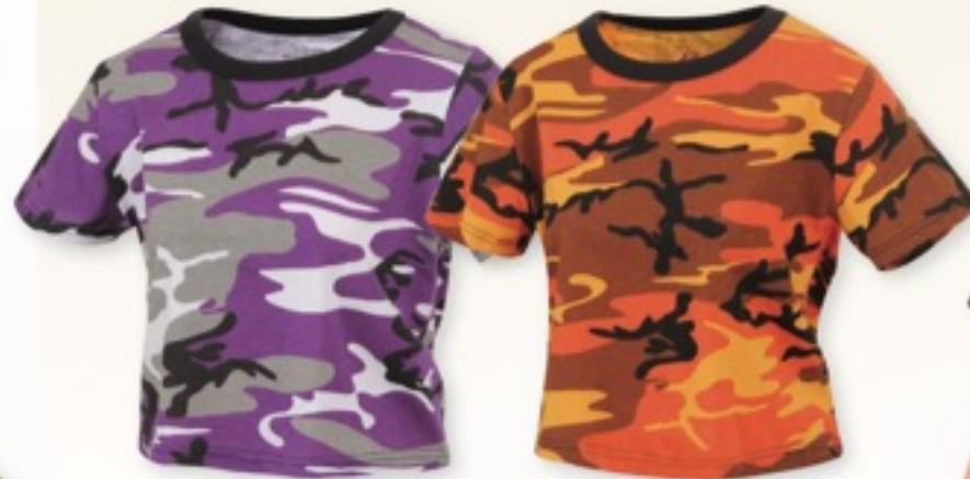
1941 ULTRA VIOLET CAMO

ROTHCO WOMENS CAMOUFLAGE CROP TOPS , 60% cotton/40% poly, Sizes: XS, S, M, L, XL, 2XL