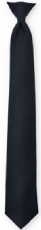
30086 ROTHCO MIDNIGHT NAVY BLUE 20" CLIP ON TIE , 100% polyester