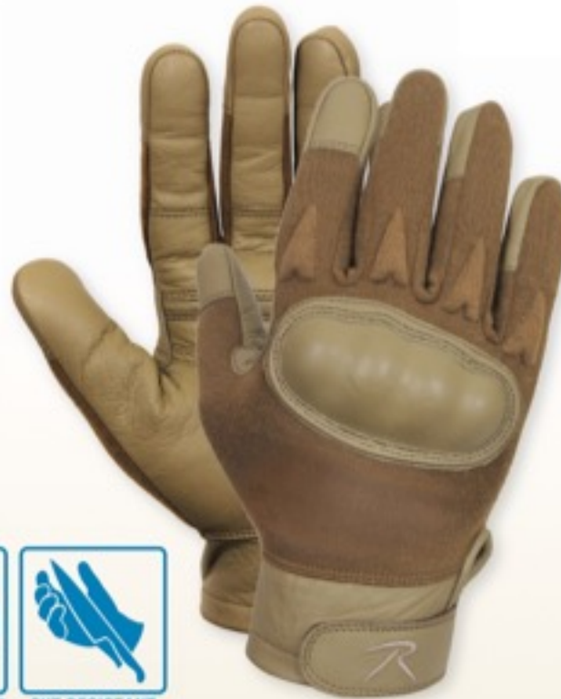
2807 COYOTE BROWN