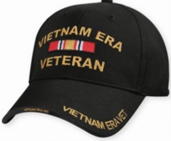
7619 ROTHCO VIETNAM ERA VETERAN BLACK CAP, comfortable 100% brushed cotton fabric, embroidered insignia on front panel & brim, sandwich bill, back strap insignia, hook & loop closure