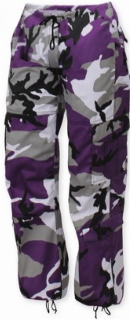
3783 ULTRA VIOLET CAMO

4922 ROTHCO WOODLAND CAMO WORKOUT PERFORMANCE SPORTS BRA , 90% polyester/10% spandex, moisture wicking, removable cups, low to medium impact for working out or for everyday wear, Available in Sizes: S to XL