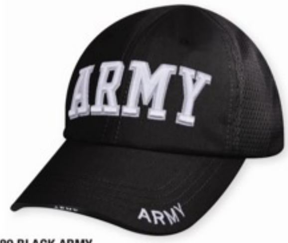
9589 BLACK ARMY