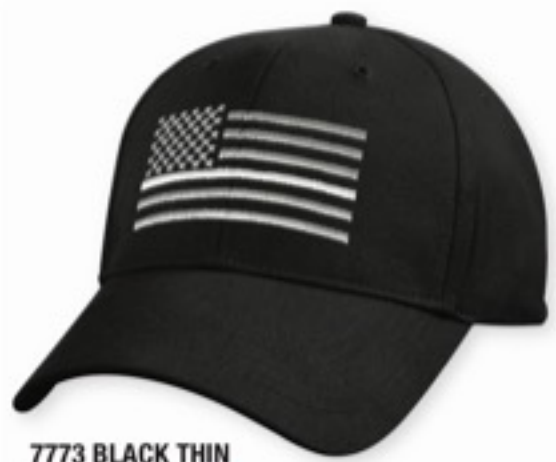
7773 BLACK THIN WHITE LINE FLAG ^