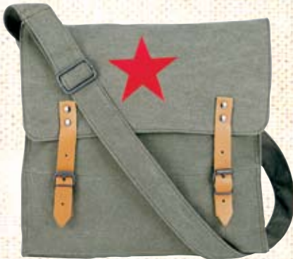
9142 CLASSIC SAGE MEDIC BAG W/RED CHINA STAR , large main compartment w/flaps & leather strap closure, adjustable shoulder strap, 12 1/2" x 11" x 3 1/2"