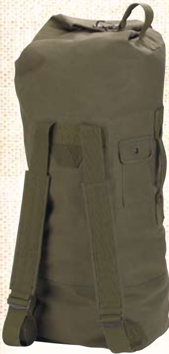
3486 G.I. STYLE O.D. DOUBLE-STRAP DUFFLE BAG, H.W. cotton canvas, 22" x 38", side handle and button pocket, adjustable shoulder straps

UNBEATABLE QUALITY... UNBELIEVABLE PRICES