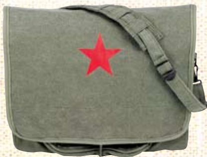
9129 CLASSIC SAGE PARATROOPER SHOULDER BAG W/ RED CHINA STAR, 3 inner compartments, 1 outer compartment w/snaps, adjustable shoulder strap, 15" x 11" x 4"