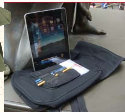
5597 SHOWN WITH IPAD

5795 VINTAGE CANVAS MILITARY TECH BAG , washed cotton canvas, padded interior w/inside zipper pocket & zipper closure, 1 outside pocket, front flap w/hook & loop closure, fits iPad, tablet computers, or netbooks, adjustable shoulder strap, 11 \frac{1}{2} "H x 7 \frac{1}{2} "W x 1 \frac{3}{4} "D, Available in 3 great colors!