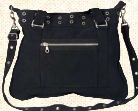
9150 BLACK VINTAGE 'PISTOL BELT' BAG , 2 carry handles, adjustable shoulder strap, zipper closure, 2 outside pockets, 1 zippered, inside pocket, silver grommets on strap and around the top of bag, 13" x 10" x 2 1/2"