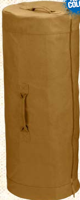
3439 COYOTE BROWN 25" X 42" ZIPPER CANVAS DUFFLE BAG, H.W. cotton canvas, reinforced top & side grab handles, D-rings