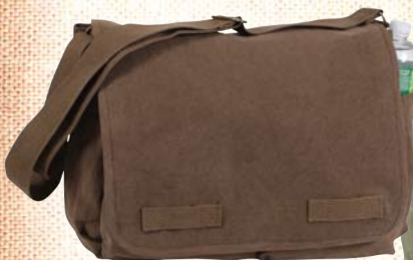
9694 BROWN CLASSIC MESSENGER BAG