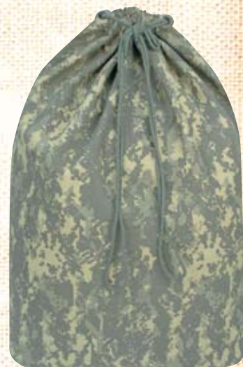
2575 G.I. TYPE ARMY DIGITAL CAMO LAUNDRY BAG , cotton canvas, drawstring closure, 24" x 32"