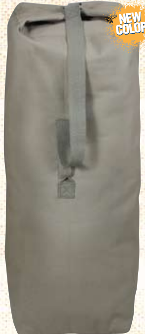
3795 JUMBO, 25" x 42"

FOLIAGE GREEN CANVAS TOP LOAD DUFFLE BAGS, H.W. cotton canvas, cotton web shoulder strap, double reinforced grab handles, snap hook closure, Available in 2 sizes