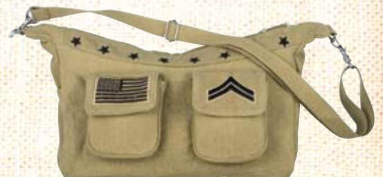
8607 KHAKI VINTAGE 2-POCKET TOP ZIP SHOULDER BAG W/STARS , adjustable shoulder strap, zipper closure, 2 front pockets w/hook & loop closure, back zipper pocket, inside compartment w/snap, 12" x 8" x 2"