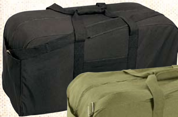
8134 BLACK JUMBO CARGO BAG, heavy-duty water-resistant cotton canvas, brass plated hardware, heavyweight webbing, adjustable shoulder strap, 34" x 16" x 15 1/2"