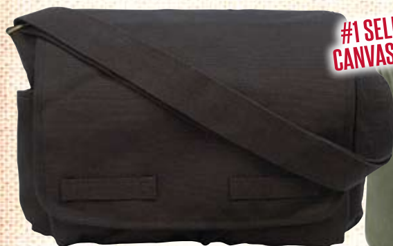
9118 BLACK H.W. CLASSIC MESSENGER BAG, unwashed