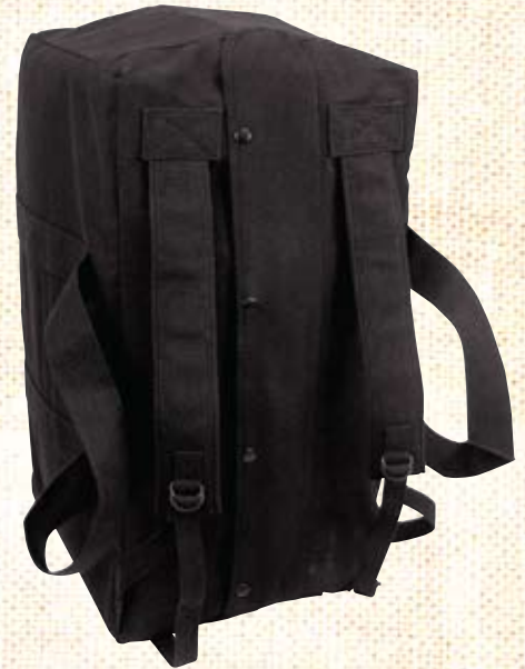
3125 BLACK MOSSAD TYPE TACTICAL CARGO BAG, H.W. cotton canvas, adjustable padded shoulder straps, snap flap covered full length zipper, reinforced web handles, 24" x 15" x 13"