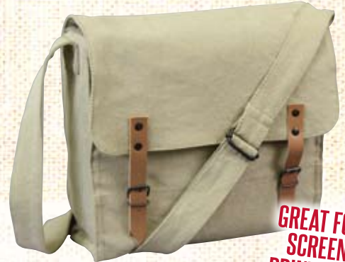
9122 VINTAGE KHAKI MEDIC BAG , large main compartment w/flap & leather strap closures, adjustable shoulder strap, 12 1/2" x 11" x 3 1/2"