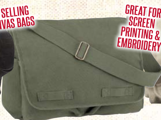
9148 O.D. H.W. CLASSIC MESSENGER BAG, unwashed