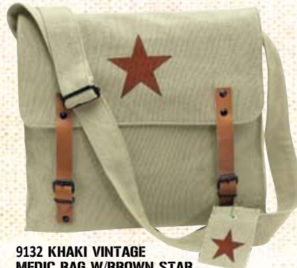
9132 KHAKI VINTAGE MEDIC BAG W/BROWN STAR , large main compartment w/flaps & leather strap closures, buckles, adjustable shoulder strap, 12 1/2" x 11" x 3 1/2"