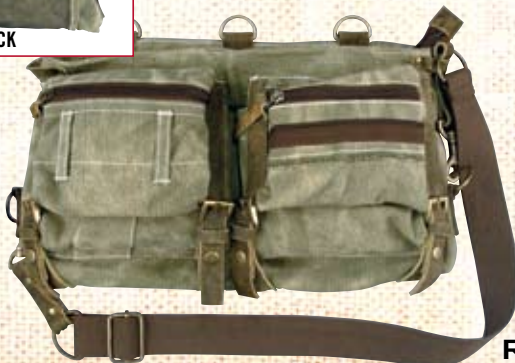
9135 H.W. O.D. STONWASHED COURIER 4-POCKET SHOULDER BAG W/MESH BACK , 2 fold up front zipper pockets, 2 hidden pockets, 1 inside pocket w/zipper, adjustable shoulder strap, 4 leather strap closures w/buckles, antique brass hardware, mesh netting on back, fully lined, 8" x 14" x 1 1/2"