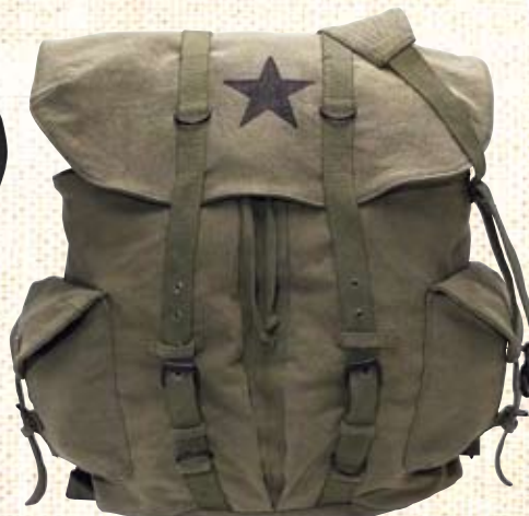
9158 O.D. W/STAR