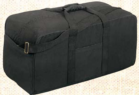
8133 BLACK ASSAULT CARGO BAG, heavy-duty water-resistant cotton canvas, brass-plated hardware, heavyweight webbing, adjustable shoulder strap, 29" x 14 1/2" x 13 1/2"