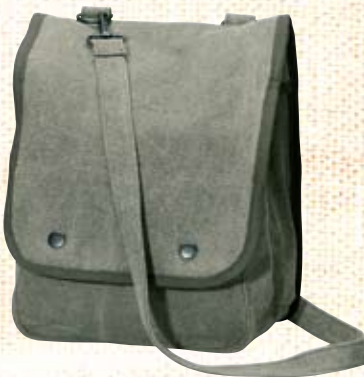
9796 VINTAGE SAGE MAP CASE SHOULDER BAG , front organizer pocket, inner divider, detachable adjustable shoulder strap, 12" x 8 1/2" x 4 1/2"