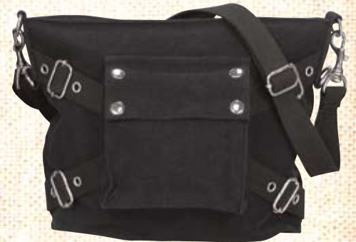
8477 BLACK VINTAGE 1-POCKET SHOULDER BAG , zipper closure, snap front pocket, belt straps w/grommets, adjustable shoulder strap, 11" x 8" x 4"