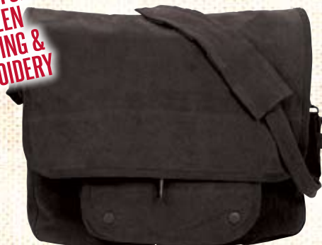
9558 BLACK VINTAGE PARATROOPER SHOULDER BAG, 3 inner compartments, 1 outer compartment w/snaps, adjustable shoulder strap, 15" x 11" x 4"