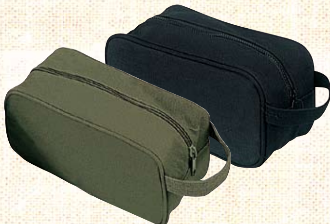
8126 TRAVEL KIT BAG , 10" x 5" x 5", H.W. cotton canvas, plastic lined, molded zipper, Choice of: O.D. or Black