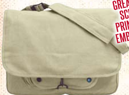
9138 KHAKI VINTAGE PARATROOPER SHOULDER BAG, 3 inner compartments, 1 outer compartment w/snaps, adjustable shoulder strap, 15" x 11" x 4"