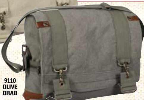
9110 OLIVE DRAB