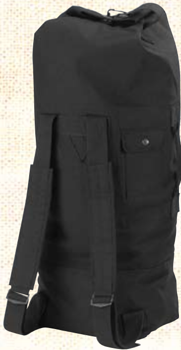
2485 G.I. STYLE BLACK DOUBLE-STRAP DUFFLE BAG, H.W. cotton canvas, 22" x 38", side handle and button pocket, adjustable shoulder straps

FOLIAGE GREEN CANVAS TOP LOAD DUFFLE BAGS, H.W. cotton canvas, cotton web shoulder strap, double reinforced grab handles, snap hook closure, Available in 2 sizes