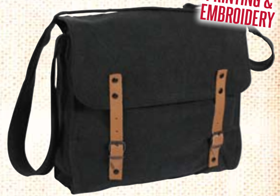
9127 VINTAGE BLACK MEDIC BAG , large main compartment w/flap & leather strap closures, adjustable shoulder strap, 12 1/2" x 11" x 3 1/2"