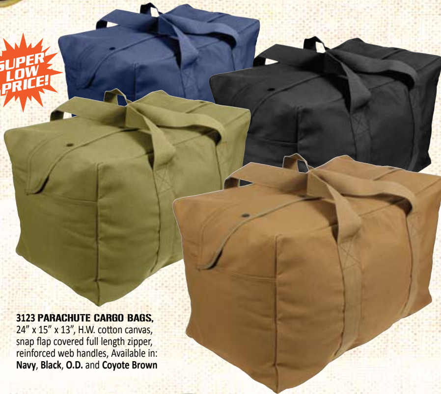
3123 PARACHUTE CARGO BAGS, 24" x 15" x 13", H.W. cotton canvas, snap flap covered full length zipper, reinforced web handles, Available in: Navy, Black, O.D. and Coyote Brown