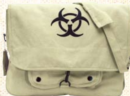
9139 KHAKI VINTAGE "BIO-HAZARD" PARATROOPER SHOULDER BAG, 3 inner compartments, 1 outer compartment w/snaps, adjustable shoulder strap, 15" x 11" x 4"