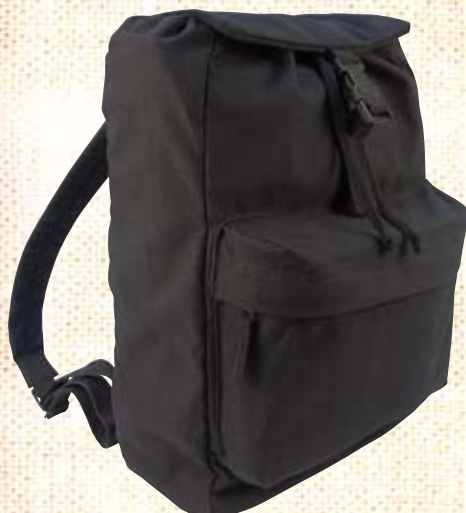
2369 BLACK CANVAS DAY PACK , H.W. cotton canvas, 17" x 12" x 10", zipper pocket lid, front zipper pocket, adjustable padded backpack straps, hang loop, water resistant

G.I. TYPE HW CANVAS MINI ALICE PACKS , three large outside pockets, drawstring top w/overlap, adjustable shoulder straps, 13" x 16" x 7", Available in: O.D. (2487) , or BLACK (2477)