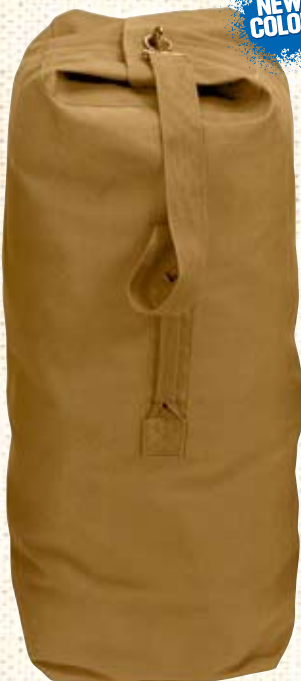
3895 COYOTE BROWN 25" X 42" TOP LOAD CANVAS DUFFLE BAG, H.W. cotton canvas, cotton web shoulder strap, reinforced grab handle, snap hook closure