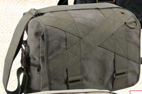
9115 OLIVE DRAB