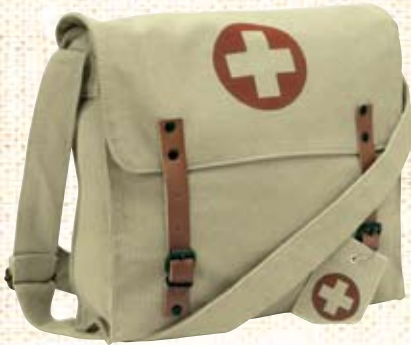
9121 KHAKI VINTAGE MEDIC BAG W/CROSS , large main compartment w/flaps & leather strap closure, adjustable shoulder strap, 12 1/2" x 11" x 3 1/2"

ROTHCO CLASSIC PACKS & SACKS , We've taken our best selling military bags and made them in our great looking washed cotton canvas to create a true classic - Classic Packs & Sacks