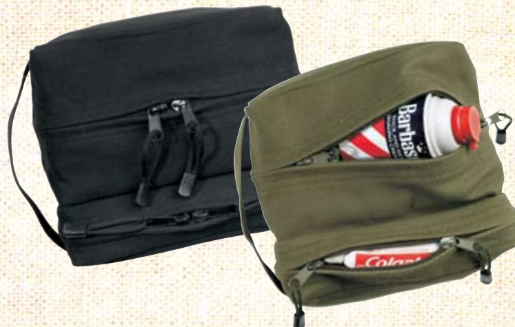
9126 DUAL COMPARTMENT TRAVEL KIT BAG , H.W. cotton canvas, 2 zippered compartments, plastic lined, choice of Black or Olive Drab