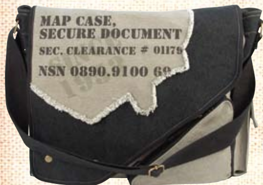
9248 VINTAGE 2-TONE IMPRINTED MAP CASE SHOULDER BAGS, soft washed cotton canvas, large main compartment w/zipper closure, inside zippered pocket, side snap pocket, front zippered pocket, 2 outside pockets, 2" adjustable shoulder strap, 15" x 14" x 4", Available in: Black w/Grey or O.D. w/Tan