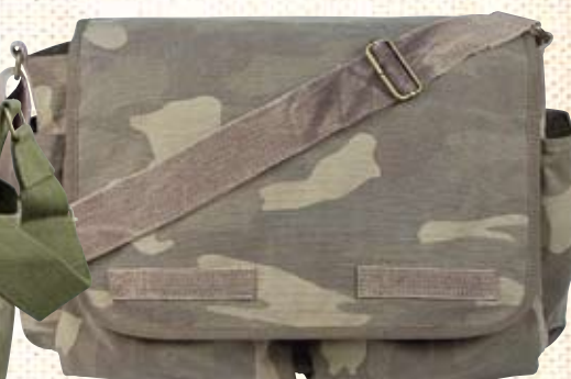
9748 WOODLAND CAMO CLASSIC MESSENGER BAG