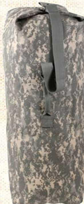
3595 ARMY DIGITAL CAMO JUMBO TOP LOAD DUFFLE BAG, 25" x 42", heavyweight cotton canvas, shoulder strap, double reinforced handle, snap hook closure