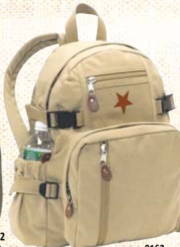
9162 KHAKI W/STAR