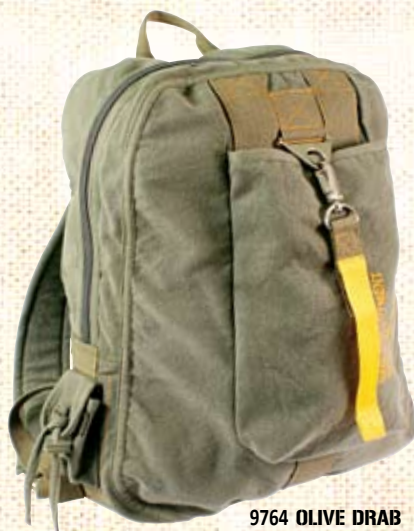
9764 OLIVE DRAB