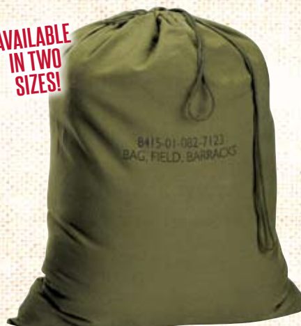
G.I. TYPE O.D. CANVAS LAUNDRY BAGS , drawstring closure, Available in 2 Sizes: 24" x 32" (2571) or 18" x 27" (2574)