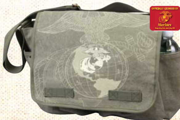
9744 O.D. CLASSIC MESSENGER BAG W/EXPLODED USMC GLOBE & ANCHOR PRINT