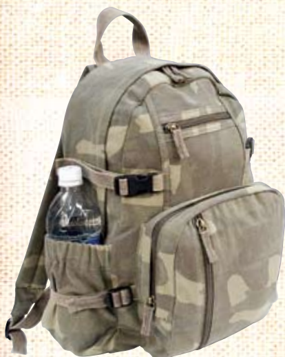
9762 WOODLAND CAMO