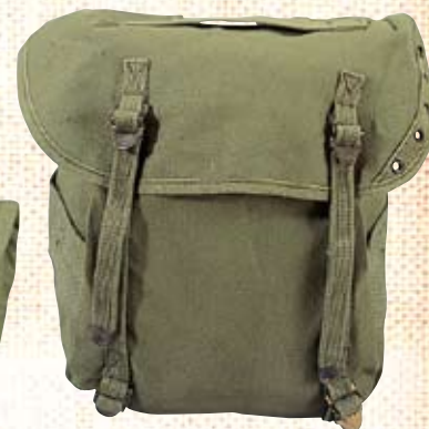
8108 G.I. STYLE O.D. CANVAS BUTT PACK , 9" x 8½" x 6", w/belt clips

CANVAS 7-POCKET FANNY PACKS , large rear main chamber w/covered zipper, 2 zippered chambers & 4 hook & loop closed cargo pockets, quick release buckle, H.W. cotton canvas, Available in: O.D. (4257) or BLACK (4258)