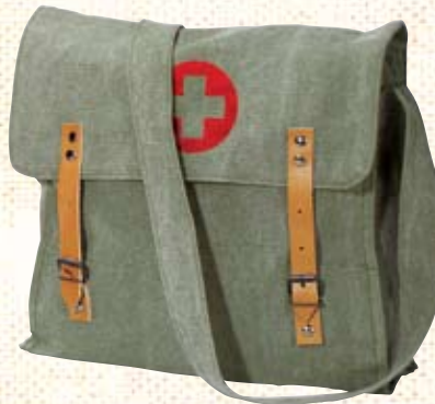
9141 CLASSIC SAGE MEDIC BAG W/CROSS , large main compartment w/flaps & leather strap closure, adjustable shoulder strap, 12 1/2" x 11" x 3 1/2"