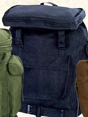
2304 NAVY BLUE