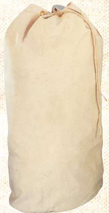
2642 U.S.N. H.W. SEA BAG, 25" x 36", heavy canvas