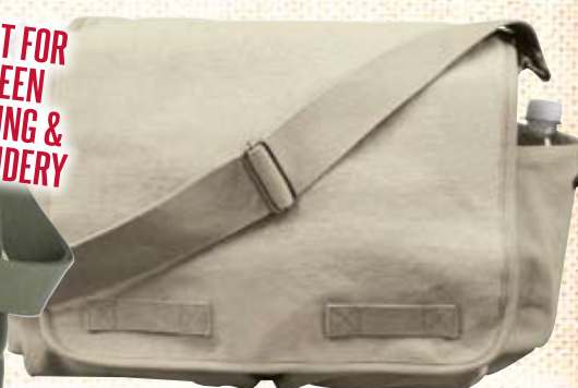
9848 KHAKI CLASSIC MESSENGER BAG