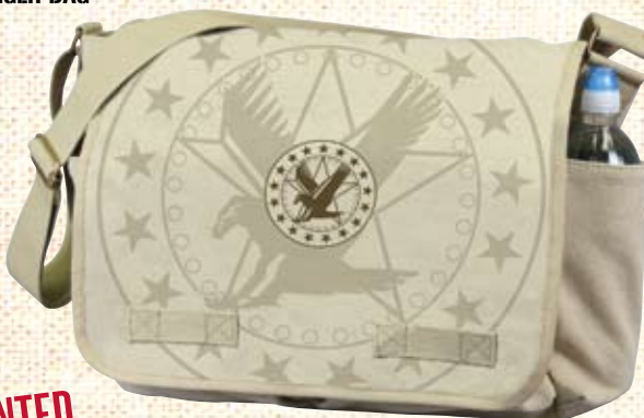
9844 KHAKI CLASSIC MESSENGER BAG W/EXPLODED ARMY EAGLE PRINT