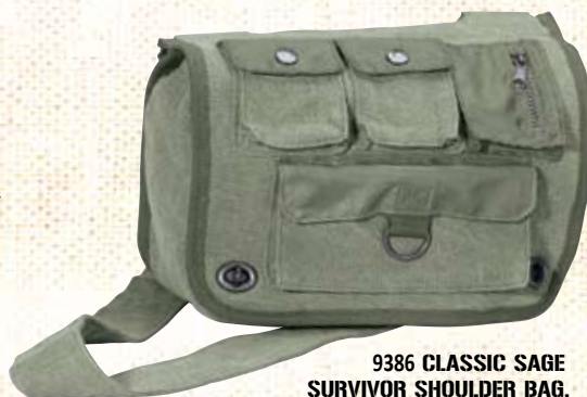
9386 CLASSIC SAGE SURVIVOR SHOULDER BAG, water repellent nylon lining, flip-up 4 compartment front, side phone pouch, rear pocket, large main compartment, adjustable canvas strap, 10" x 11" x 5"