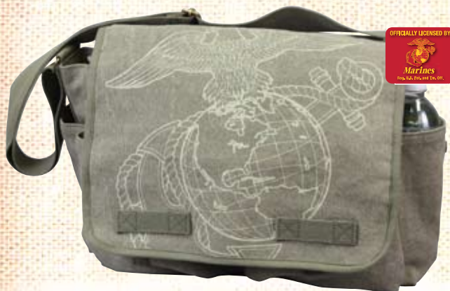
9849 O.D. CLASSIC MESSENGER BAG W/SUBDUED USMC GLOBE & ANCHOR PRINT