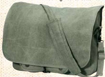
9128 CLASSIC SAGE PARATROOPER SHOULDER BAG, 3 inner compartments, 1 outer compartment w/snaps, adjustable shoulder strap, 15" x 11" x 4"

ROTHCO CLASSIC PACKS & SACKS, We've taken our best selling military bags and made them in our great looking washed cotton canvas to create a true classic - Classic Packs & Sacks