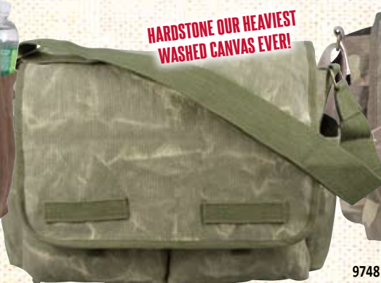
9137 H.W. O.D. STONEWASHED CLASSIC MESSENGER BAG