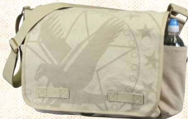
9847 KHAKI CLASSIC MESSENGER BAG W/SUBDUED ARMY EAGLE PRINT