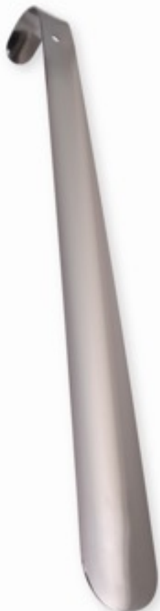
1014 ROTHCO STAINLESS STEEL SHOE HORN, 16.5" long, 1 5/8" wide, poly bagged