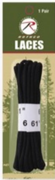
7258 BLACK NYLON 61" BOOT LACES, 1 pr.