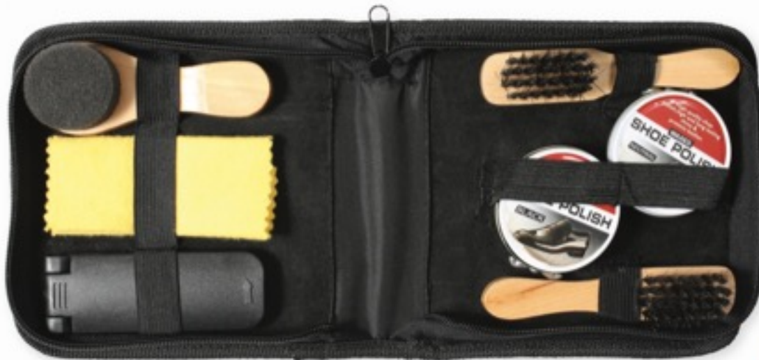
10420 ROTHCO SHOE CARE KIT , includes shoe horn, lint brush, cleaning cloth, wood handle shoe sponge & 2 brushes, black and natural polish, nylon carry pouch*