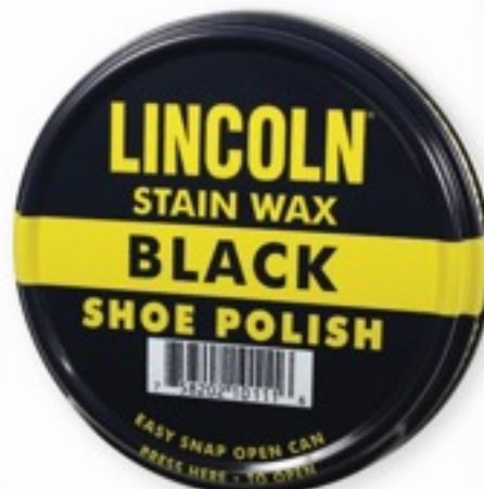
10110 LINCOLN USMC BLACK STAIN WAX SHOE POLISH , Genuine issue, U.S. made, 2 1/8 oz. can, 12 per display box