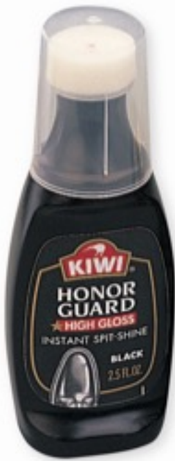
10105 KIWI HONOR GUARD MILITARY SPIT-SHINE POLISH, 2½ fl oz. black, high gloss, U.S. made