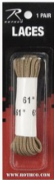
7158 61" DESERT TAN BOOT LACES, 1 pr.