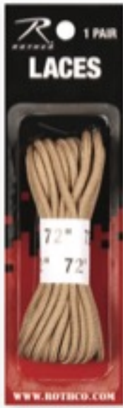
7159 72" DESERT TAN BOOT LACES, 1 pr.