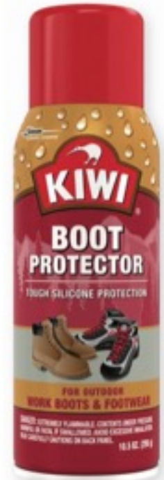
10143 KIWI BOOT PROTECTOR, 10.5 oz., bonds to leather and other boot materials to create a tough water barrier, breathable, odorless when dry, ideal for work and outdoor boots