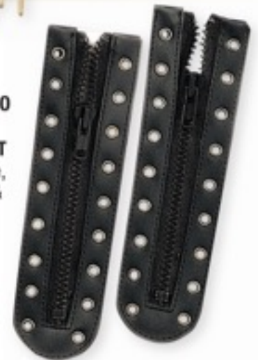
6195 ROTHCO G.I. TYPE ZIPPER BOOT LACE, 9-hole, fits combat & jungle boots, PVC leather*