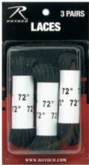
61913 72" BLACK NYLON BOOT LACES, 3 pk