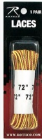
6158 72" TAN NYLON WORK BOOT LACES, 1 pr.