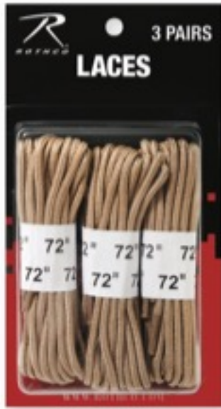
61914 72" DESERT TAN BOOT LACES, 3 pk