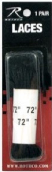
6191 72" BLACK NYLON BOOT LACES, 1 pr.