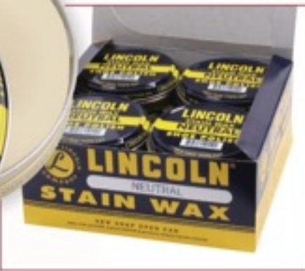
20110 USMC LINCOLN NEUTRAL STAIN WAX SHOE POLISH , provides a quick, bright & lasting water resistant shine, ideal for leather or corfam, U.S. made, 2 1/8 oz. can, 12 per display box