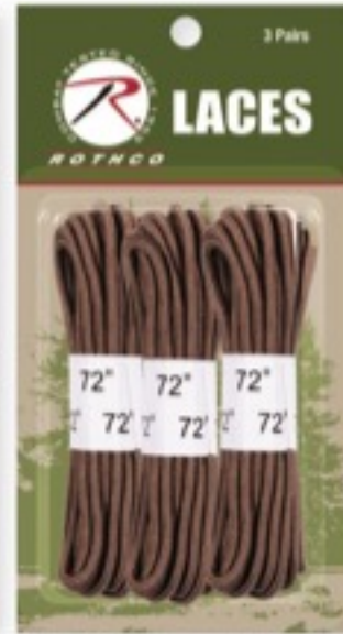
6017 72" COYOTE BROWN BOOT LACES, 3 pk