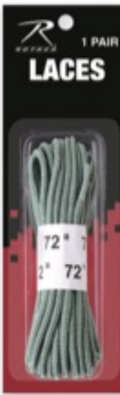
7805 72" FOLIAGE GREEN BOOT LACES, heat formed tips, 1 pr.