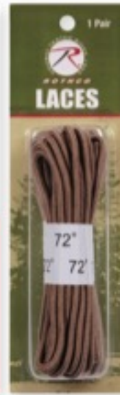
7808 72" COYOTE BROWN BOOT LACES, 1 pr.