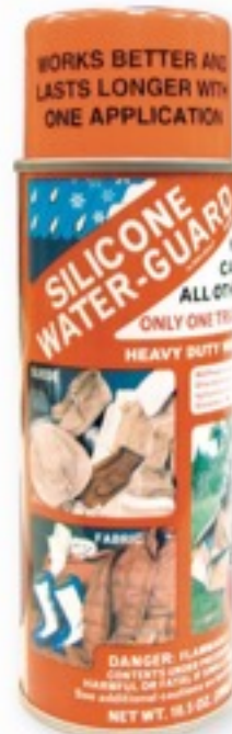
10128 SILICONE WATER GUARD, from the makers of SNO-SEAL, 12 oz. aerosol, for use on outerwear, footwear, tents, suede & more