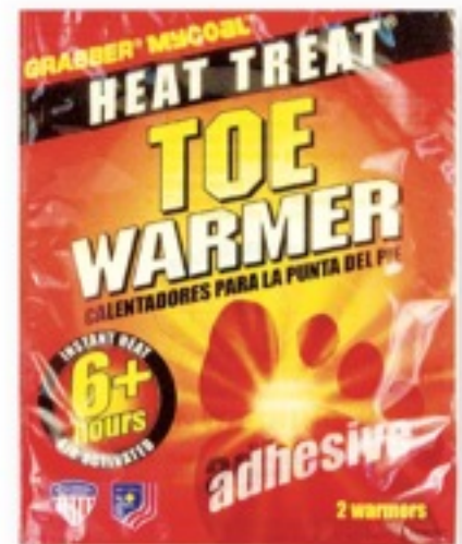
4823 TOE WARMERS, thin, rounded toe, adhesive back, over 6 hours of warmth, 2 per pack