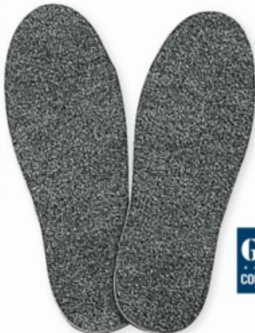
6187 ROTHCO COLD WEATHER HEAVYWEIGHT INSOLES, 5/16" thick, 3 layer construction for warmth & comfort, Sizes: M, L