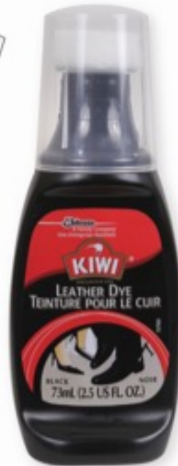
10134 KIWI BLACK LEATHER DYE, 2.5 oz., no-mess plastic applicator bottle, water resistant, restores color to worn out leather before polishing, U.S. made