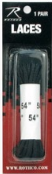
6171 54" BLACK NYLON BOOT LACES, 1 pr.