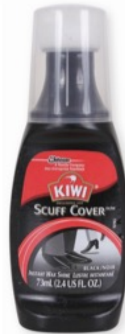
11105 KIWI SCUFF COVER LIQUID, 2½ oz., black, water resistant, instant no-buff shine