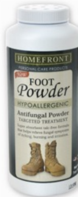
8261 MILITARY ANTIFUNGAL FOOT POWDER, 7 oz., super absorbent talc-free formula, relieves itching, burning & irritation, used by active soldiers, U.S. made