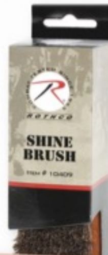
10409 ROTHCO SHOE SHINE BRUSH , 7" x 2", wood handle, 100% horsehair bristles, excellent for shining shoes & boots