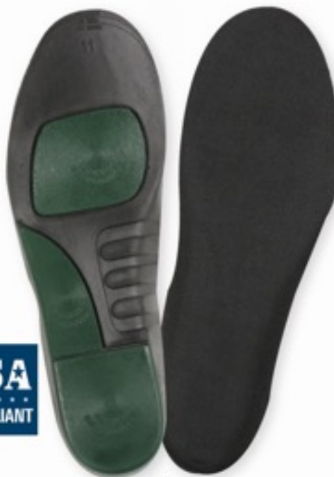
7187 ROTHCO BLACK MILITARY/ PUBLIC SAFETY CONTOURED INSOLES, polyurethane bottom, cloth top, contoured for arch support, Sizes: 6-7, 8-9, 10-11, 12-13*