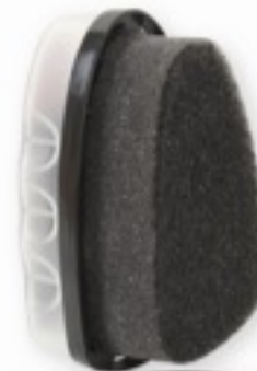
10102 KIWI EXPRESS SPONGE, 2 oz., black, provides a quick instant shine, no mess, no buffing