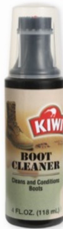
10142 KIWI DESERT BOOT CLEANER, 4 fl. oz., removes dust, dirt and stains from suede and nylon uppers