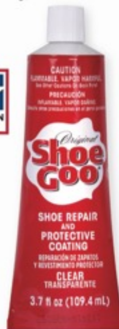
10012 SHOE GOO, #1 waterproof shoe adhesive, ideal for fixing worn soles, damaged heels or small holes, perfect for coating or sealing galoshes, waders or rubber boots, 3.7 oz., U.S. made*