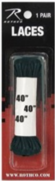
6061 40" BLACK NYLON LOW QUARTER DRESS SHOE LACES, 1 pr.