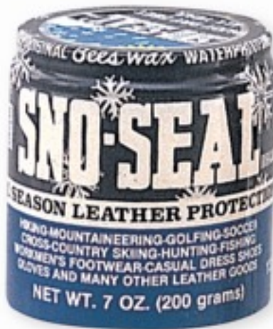
10120 SNO-SEAL, 7 fl. oz., waterproofs and protects leather