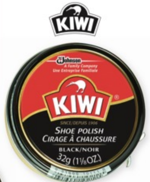
10130 KIWI BLACK SHOE PASTE POLISH , 1 1/8 oz., U.S. made, provides long lasting standard gloss shine