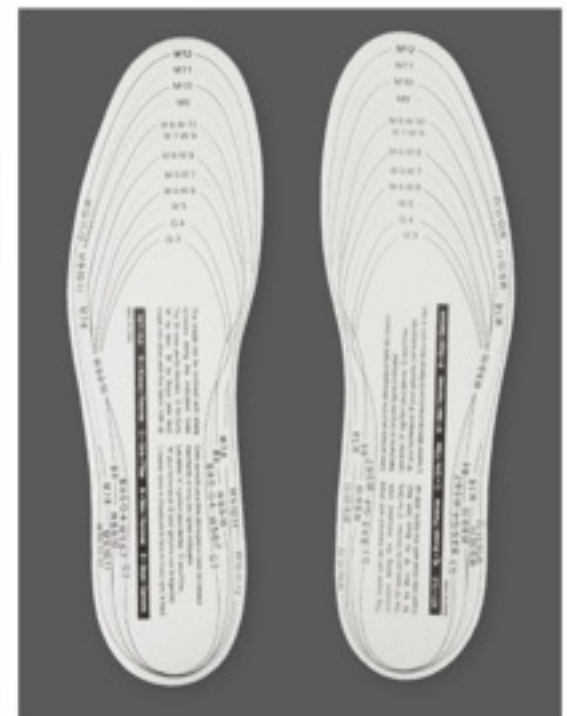
7127 ROTHCO WHITE MEMORY FOAM INSOLES, EVA top & bottom, 4mm memory foam center, cut to size, fits Men's sizes: 4 to 13 or Women's sizes 5 to 10